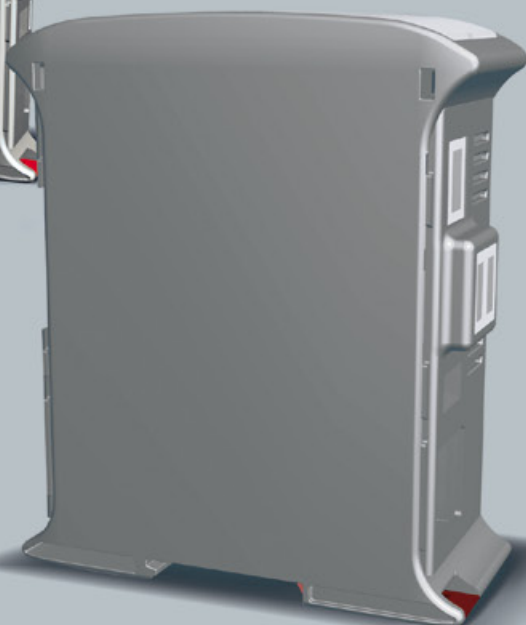
Kit 45 Railbox